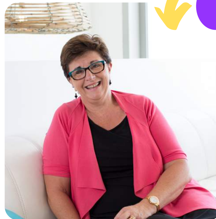
MAGGIE DENT Author, Educator & Parenting Educator

Over 40 ParentTV experts provide research-based advice that is easy to understand via short, smart videos for busy teachers, parents, grandparents, carers....anyone who is helping to raise kids.